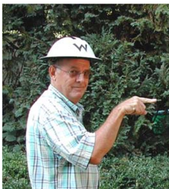
From the 2003 edition of Stage Whispers

So please aspiring editors with Publisher or Word skills please step up and volunteer to publicy the Whips activities contact me , Jackgriffith6@gmail.com and I'll show you the ropes